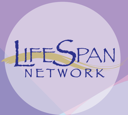
Exhibit and Sponsor Packet